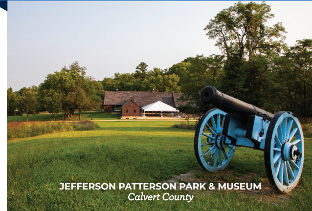
JEFFERSON PATTERSON PARK & MUSEUM Calvert County